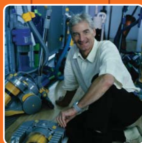
James Dyson – Design Engineering