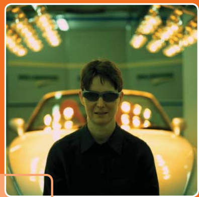
'When you have a burning desire TO TAKE APART ANYTHING that moves you are BORN to be an ENGINEER'.